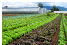
Farm to Plate

The Park extends heartfelt thanks to DBT-BIRAC for their immense support.